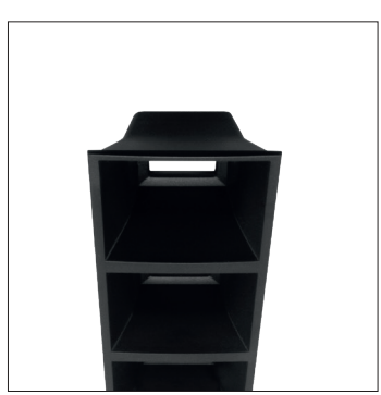
BM lens shade