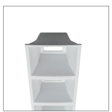
WM lens shade